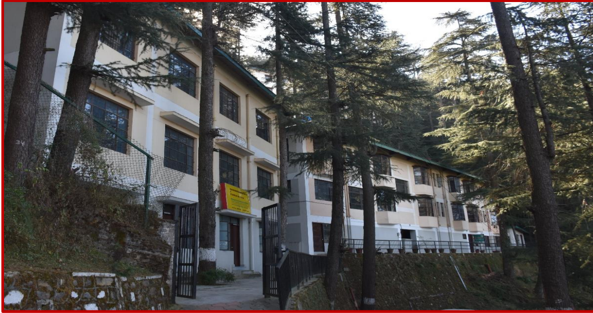
Photo of ICFRE-HFRI Guest House