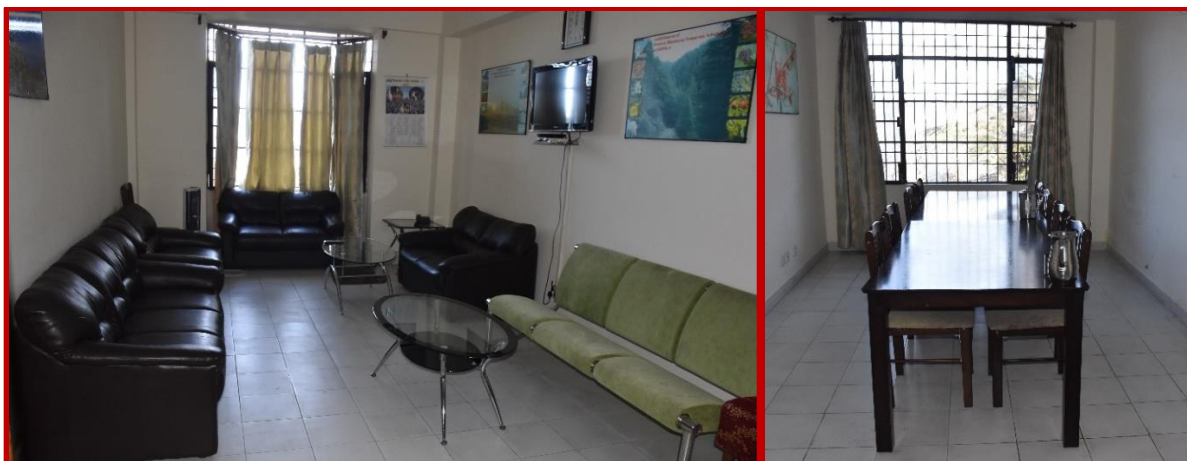
Photos of Rooms

The Charges of Guest House include Room Rent Charges plus maintenance charges listed as follows: